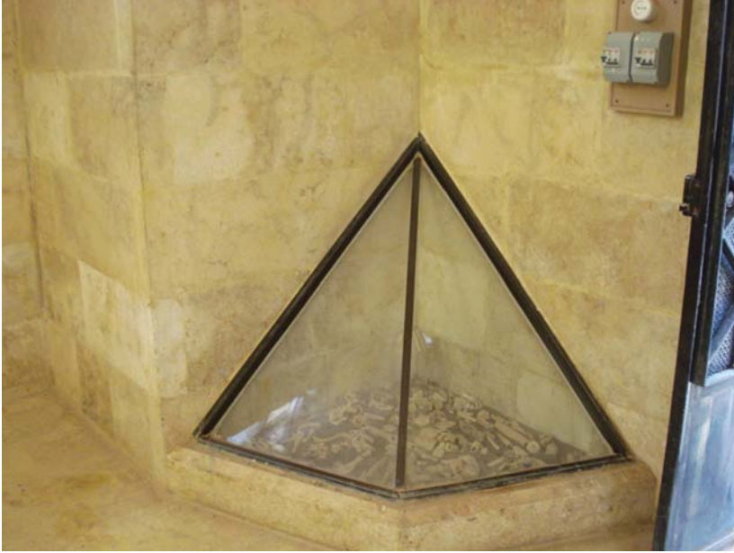
Figure 3 The small ossuary at the St Haroutiu chapel at Margada, Syria.