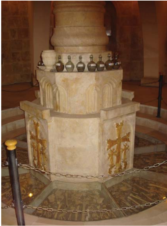
Figure 4 The Armenian Genocide Memorial inside the Armenian Martyrs' church in Dayr al-Zur. The monument contains crosses ( khatchars ) that traditionally adorn Armenian gravestones, soil from the points of origin of Armenian deportees, and bones encased in an ossuary at the foot of the memorial. Photo by author. All rights reserved; permission to use the figure must be obtained from the copyright holder.

The second stop, Margada – about 70km north of Dayr al-Zur – is the site of a mass grave where an estimated 80,000–100,000 souls perished on the march between Margada and Shaddadi. 26 One could probably pass Margada, situated in a vast swath of unforgiving desert, without even noticing it. There is little settlement there, which fits the pattern of many mass-grave sites outside Dayr al-Zur. From the road, one sees a large mound of earth. What does not appear until a closer glance is that the earth is packed with human bones. In 1999, the same decade as the Dayr al-Zur memorial complex and church were completed, St Haroutioun chapel was built by the Armenian Apostolic Church to offer official recognition for those who perished at Margada. The red sandstone-walled structure contains a tiny one-chamber chapel that also serves as a monument, with a small triangular ossuary for the human bones that are displayed there.