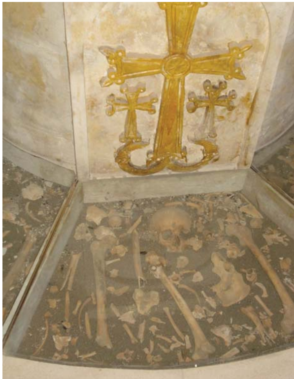
Figure 5 The Armenian Genocide Museum monument within the Armenian Martyrs' church at Dayr al-Zur. Photo by author. All rights reserved; permission to use the figure must be obtained from the copyright holder.

Not far from Margada, on the road to Hassaka, is the third pilgrimage station, Shaddadi, a small town of newer construction that sprung up around the oil industry. Hugging the Khabur river is the original village of Shaddadi. Armenian deportees from Aleppo were held for six months in Dayr al-Zur, where hundreds died daily of hunger and disease. In June 1916, approximately 200,000 Armenians were deported north of Dayr al-Zur to the killing fields where they were executed by Chechen irregulars. 27 On 15 July 1916, 18,000 Armenian women and children were marched into the desert, crossing the Zur bridge and arriving Shaddadi a few days later; there the survivors of the march were gathered on a mound next to the river. 28 The villagers remember how girls were gathered on the mound of Tel Shaddadi one night, and the district chief, knowing they were to be killed the next day, sheltered some of the girls in the homes of residents to save them. Those who remained were marched into the desert and burned alive at the cave where Armenian pilgrims now descend to bear witness at the site. 29