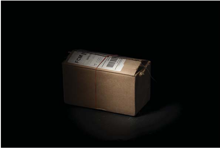
Figure 7 Original caption: ‘Hundreds of thousands of Armenians were marched into the Syrian desert. Above a box contains the bones of an Armenian who died there.’

rituals offer us a way to think about the history that lies beneath the affective landscape of Dayr al-Zur. Yet, the bones of Armenians scattered in the Syrian desert are hardly a display. The abandonment of bones in the landscape can inspire us to think of the ethical implications of the largely unmarked space where hundreds of thousands perished. Thinking about century-old Armenian bones in the desert should not detract from reports of mass graves of ISIS victims recently discovered in Dayr al-Zur. 45 If so few remember the Armenians today, even fewer will remember Sunni Muslim victims in Dayr al-Zur – Arab tribesmen who resisted the repugnant black flag. Ironically, many Arabs of the desert are the descendants of intermarriage between local Arabs and Armenian women genocide survivors who were marched into the desert.