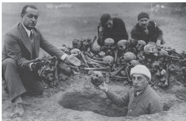
Figure 1 A 1938 expedition of Armenians led by Harutyun Hovakimyan, holding a skull, in Dayr al-Zur. Published with permission from the Armenian Genocide Museum Institute. All rights reserved; permission to use the figure must be obtained from the copyright holder.

While Krikorian took his photographs decades after the Genocide, he followed a tradition of displaying Armenian remains in various states of decomposition in World War I photography. The production and dissemination of such images were primarily evidentiary, aimed at confirming the facts of genocide through the 'objective' lens of the camera. 7 Among these early photographs is Harutyun Hovakimyan's expedition to Dayr al-Zur in 1938. As he holds the skull of an Armenian Genocide victim in his hand, his colleague gestures to it with his left hand while holding bones in the right (Figure 1). The image not only emphasises the sheer volume of bones discovered in eastern Syria after the war but compels the viewer to witness the war crime along with the excavation team. Yet, photography has conversely been used in the service of Turkish state denialism in which Armenian mass graves are Turkified. Necropolitical power is projected across the border into Syria to counteract public memory and remembrance practices of Armenian deaths in these spaces. 8 Such denial renders the bones (not to mention Armenian lives) subject to disposal, as the state affirms Turkish biopower over each newly discovered mass grave. The Turkish ambassador to the United States, Nabi Şensoy, quipped, 'Bones you can find anywhere in Turkey. There have been a lot of tragedies in those lands.' 9 Hence, even